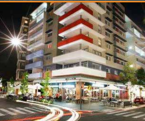
Rouse Hill Town Centre