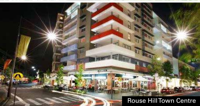
Rouse Hill Town Centre