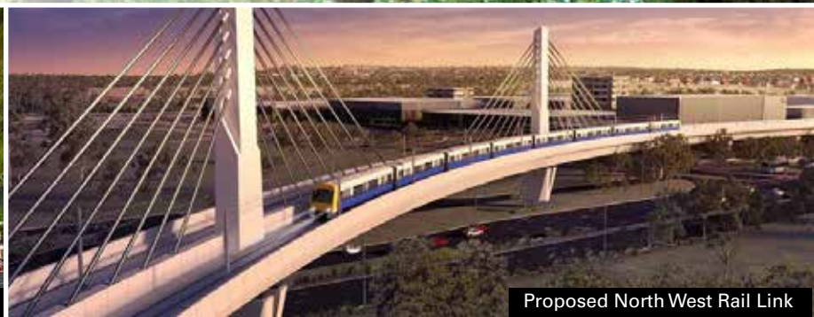
Proposed North West Rail Link